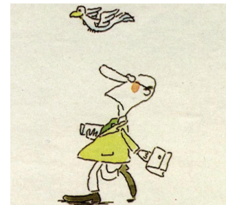
Fig. 1. "Red Bull Gives You Wings."

Red Bull, one of the most popular brands, actually was invented in the 1970s in Thailand, and it was first exported to the United States in 1997 (FundingUniverse). From the beginning, Red Bull's advertising has been squarely aimed at college